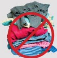
CLOTHING/ TEXTILES DON'T BELONG