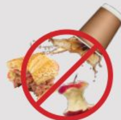
FOOD WASTE/ LIQUIDS DON'T BELONG