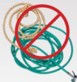
TANGLERS DON'T BELONG