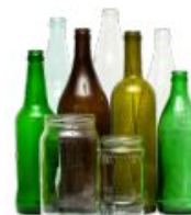
Glass Bottles & Jars (Empty food & beverage bottles & jars)