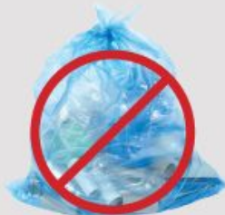
BAGGED RECYCLABLES DON'T BELONG