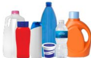
Plastic Bottles, Jugs, Tubs, & Lids (Empty kitchen, laundry, & bath containers)