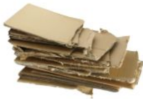
Corrugated Cardboard (Wavy center layer)