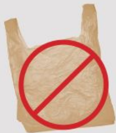
PLASTIC BAGS DON'T BELONG