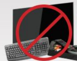
ELECTRONIC WASTE ITEMS DON'T BELONG