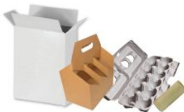
Boxboard (Dry-food boxes, egg cartons, & rolls)