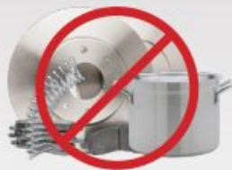
SCRAP METAL ITEMS DON'T BELONG