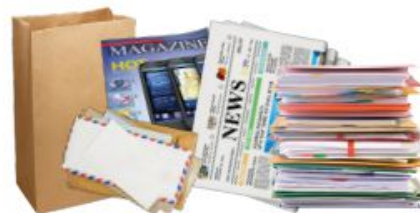
Junk Mail, Periodicals, & Office Paper (Paper bags, envelopes, & catalogs)