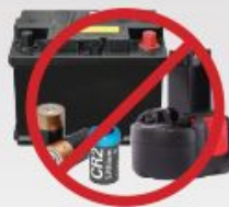
BATTERIES OF ANY KIND DON'T BELONG